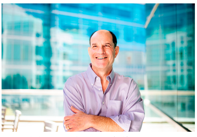
David Julius.

Since temperature is an "intensive" thermodynamic parameter (i.e., one that does not depend on the size of the system), it was difficult to think of specialized temperature receptors. However, the seminal 1997 Nature paper from Julius' laboratory demonstrated that living beings have evolved to transduce all stimuli coming from the external world using ion channels, including temperature (6). Caterina et al. (6) used an expression cloning strategy to search for the capsaicin receptor and found a single clone in which capsaicin induced a significant increase in cytoplasmic calcium. The isolated cDNA coded for a channelforming protein, now known as TRPV1, belonging to the transient receptor potential (TRP) family and expressed in small- to medium-diameter neurons of